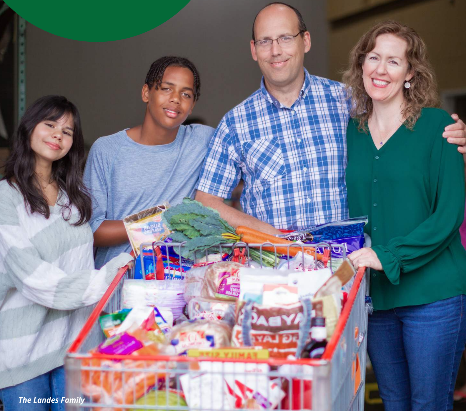
The Landes Family