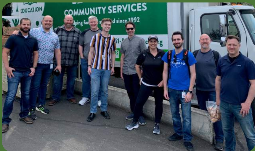
Daimler employees volunteer together at BCS