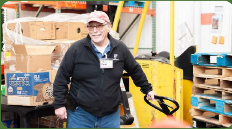
Volunteers are essential to BCS' operations