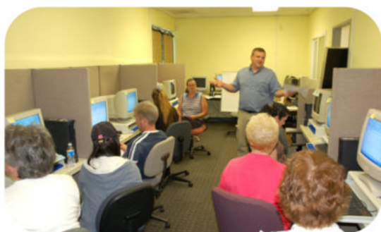
Our Computer Skills course was a huge hit in the early 2000s!