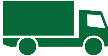
A New Truck