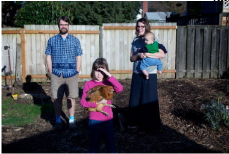
View full size ( http://media.oregonlive.com/portland_impact/photo/gardenjpg-c777f4dc0548eb3b.jpg )