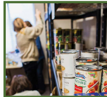
Tigard FoodShare Pantry